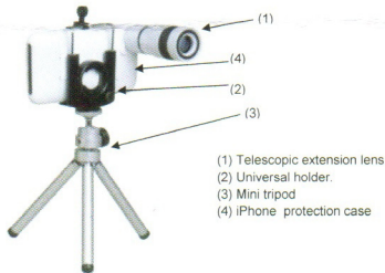
Diagram of Universal holder